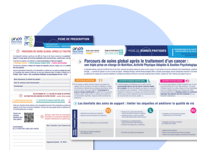
PRESCRIPTION TEMPLATE & GUIDEBOOK FOR PROFESSIONALS