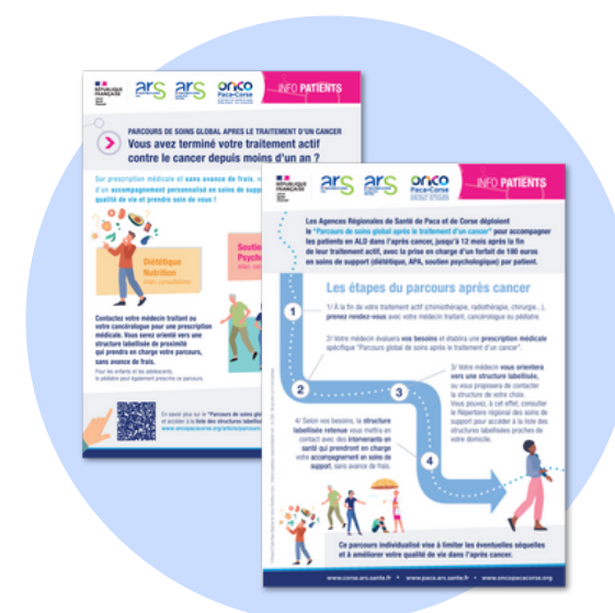
FLYERS AND POSTERS FOR PATIENTS