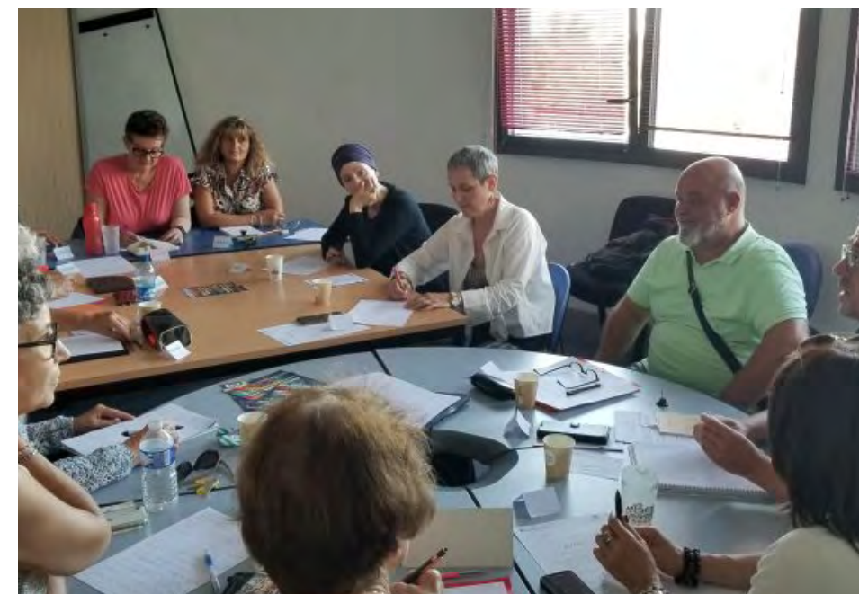
Writing workshop, a space of escape for patients.