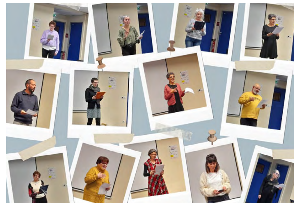
Feedback from the writing workshops: sharing, reading and emotion!