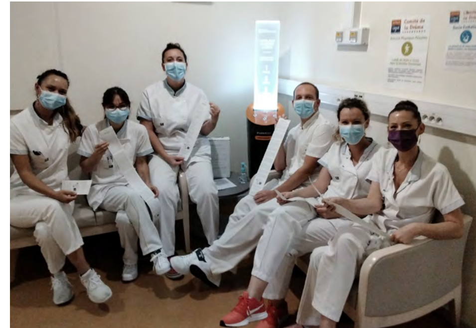
Inauguration of the Short Story Dispenser, acclaimed by caregivers.