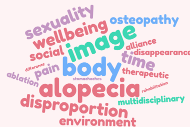
Fig. 1. Patient reported outcomes