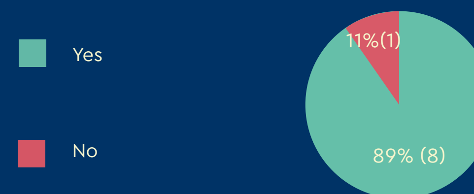
FIGURE 2. NEED OF FOLLOW-UP WITH MSC SUPPORT