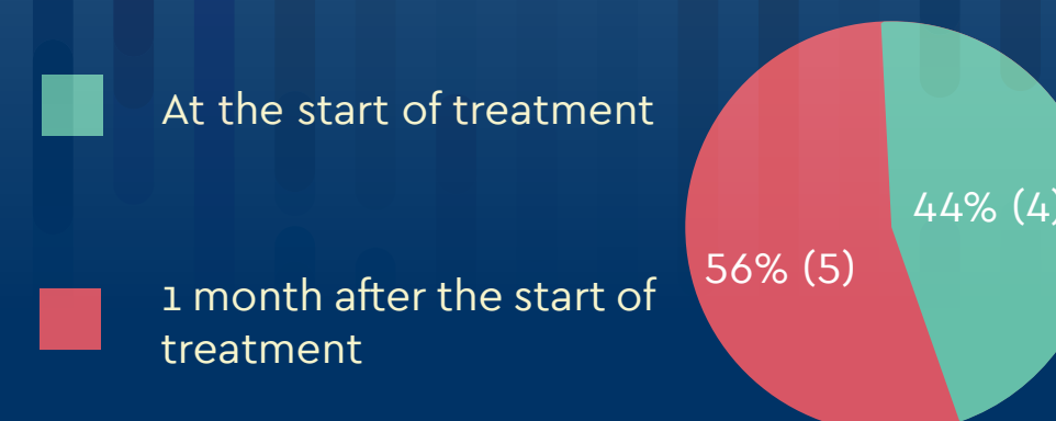
FIGURE 1. BEGINNING OF A MSC SUPPORT