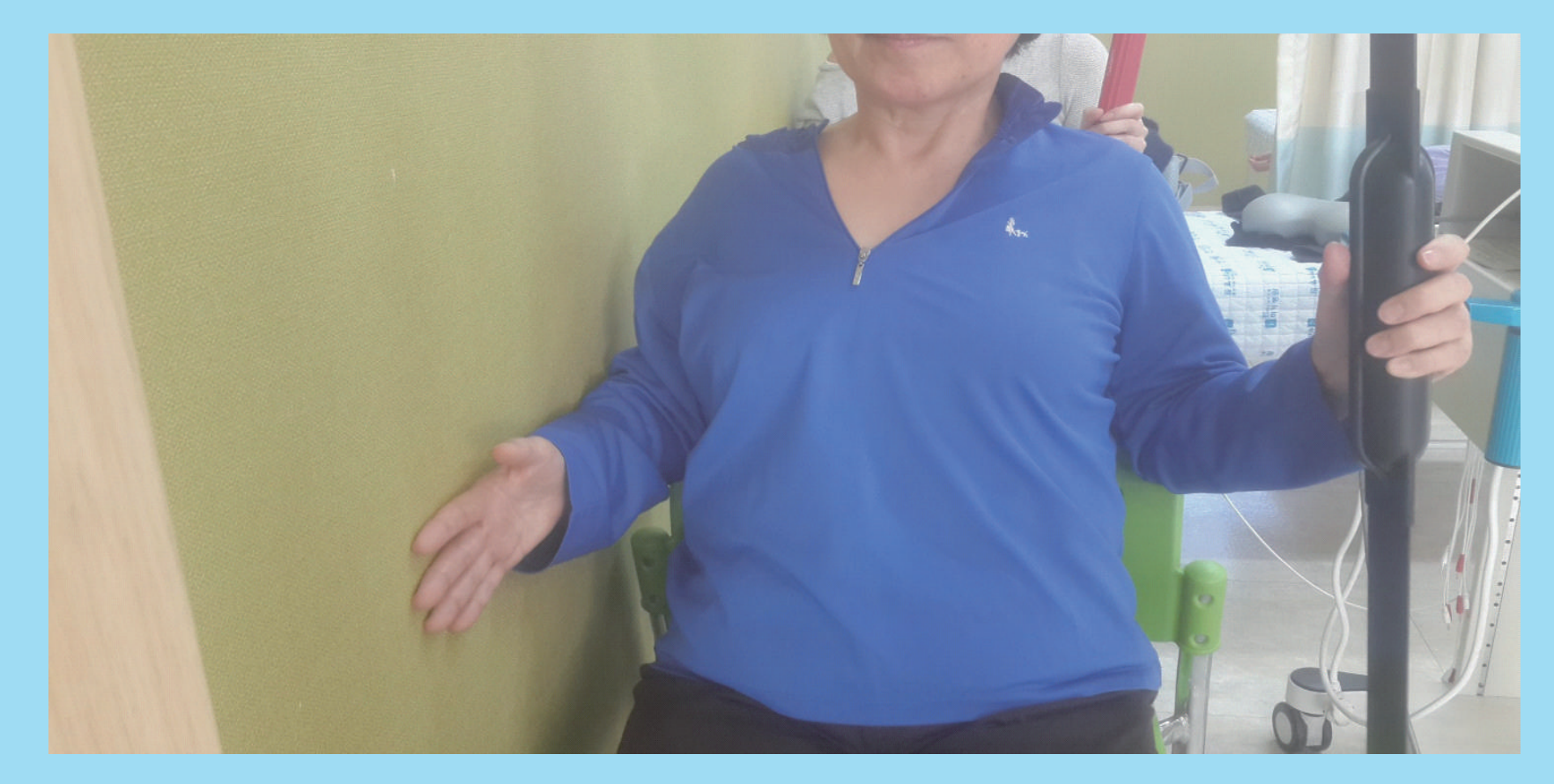
Figure 2. Contralateral cross training by using FLEXI-BAR<sup>®</sup>.