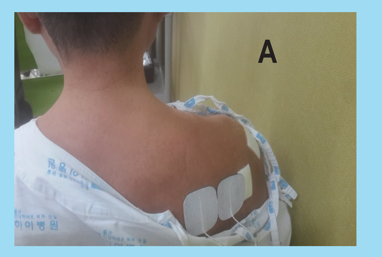
Figure 1. NMES during isometric contraction of the external rotators on affected side. (A) Placement of NMES pads, (B) Isometric exercise by using wall.

Design of this study was cross-sectional study. Participants were received NMES during isometric contraction of the external rotators on affected side (Figure 1) and conducted contralateral cross training on upper extremity by using FLEXI-BAR® (Figure 2) Pain pressure threshold for pain, manual muscle test for muscle strength, and muscle thickness with relaxed and contracted conditions on immobilized shoulder were examined pre and post interventions.