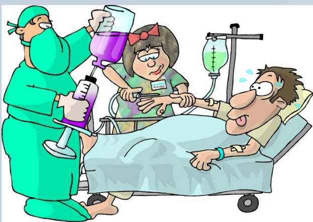
Figure 1: Illustration of an anesthesiologist